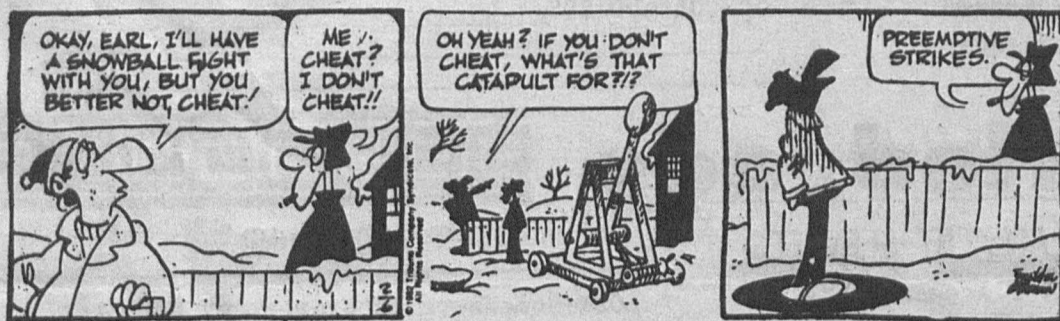
MOTLEY'S CREW

The entertainment concluded with a gladiatorial fight, a song "O Caritas", and a scene from Mostellaria . The banquet ended with a toast.